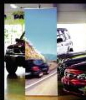
Banner Stand in a store - showroom (car dealership)