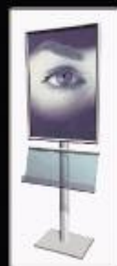
Optional brochure holder