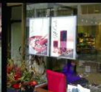
Poster Light Classic in a shop window (spa)