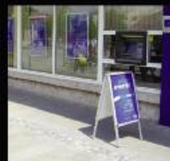
Clipframes in a shop window and A-board on sidewalk (banking)