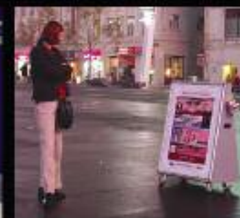
Custom Clipframes on a mobile display in the Toronto city centre (municipality)